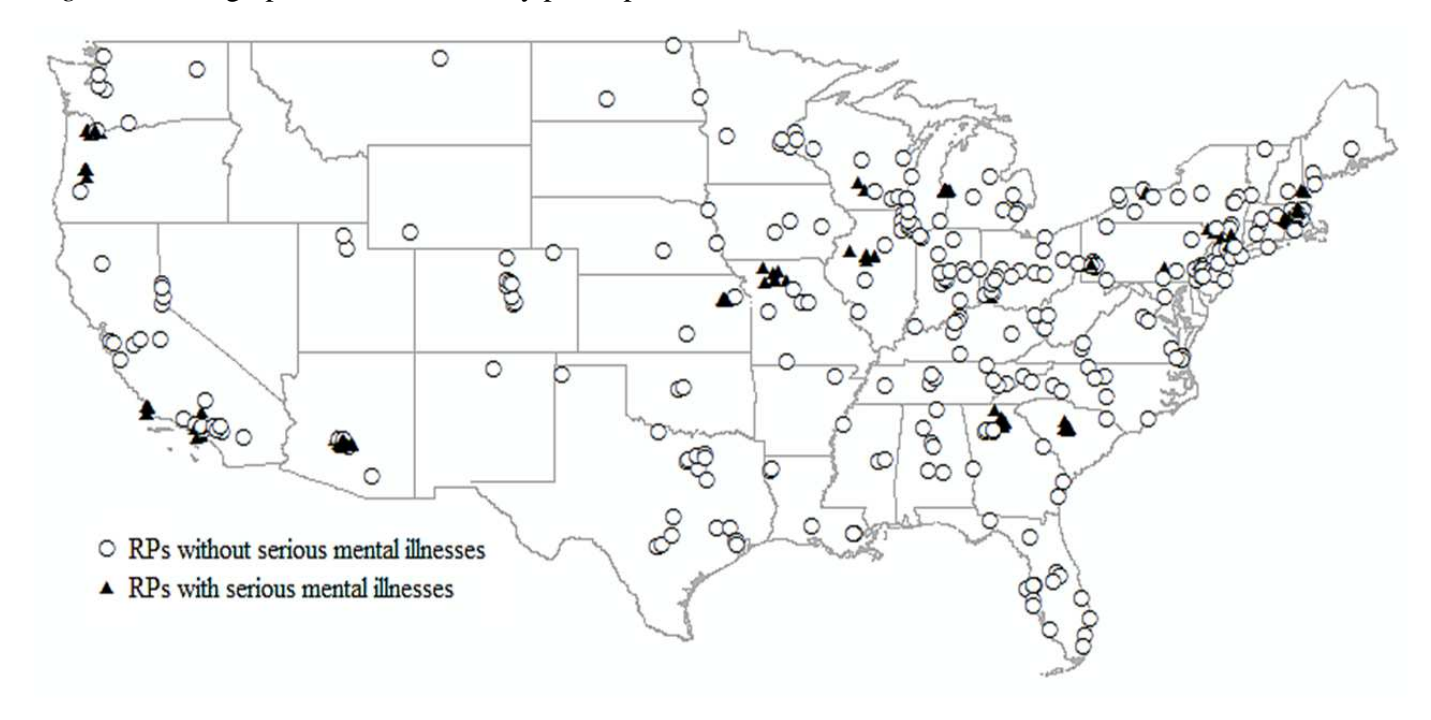
Figure S1. Geographic location of study participants